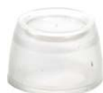
BA 221 SSK

BA 222 01, BA 223 02, BA 224 01, BA 226 01 and BA 227 01 can be used in explosion group IIB / IIIC.